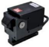
Dust proof cover + heat proof sealing + grip handle