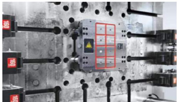
8,500kN (850ton) Die-casting machine C-plate mag clamp & Hydraulic clamp TYB