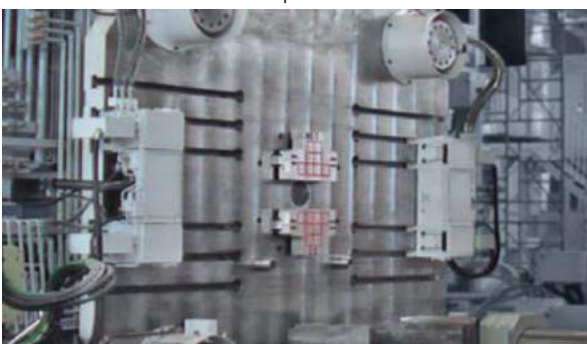
40,000kN (4,000ton) Die-casting machine C-plate mag clamp