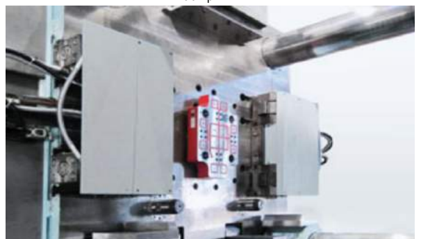
16,500kN (1,650ton) Die-casting machine C-plate mag clamp