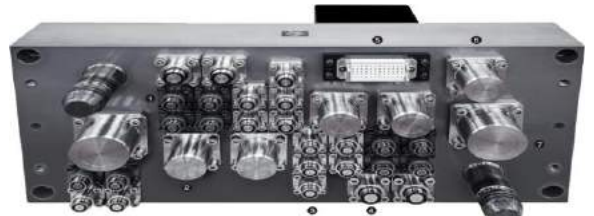
900kN Blow Molding Machine