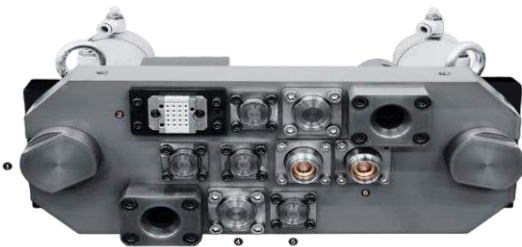
5,000kN Die Casting Machines