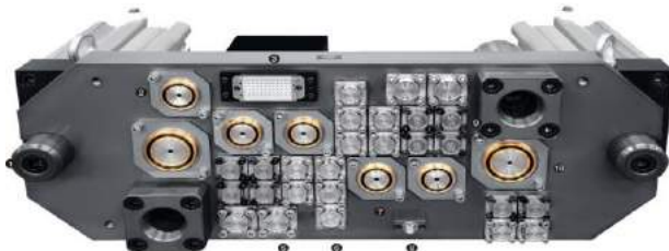
900kN Blow Molding Machine