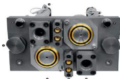
12,000kN Hot Press