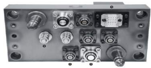
5,000kN Die Casting Machines